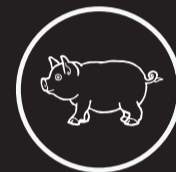
Pig in Schnit + $2